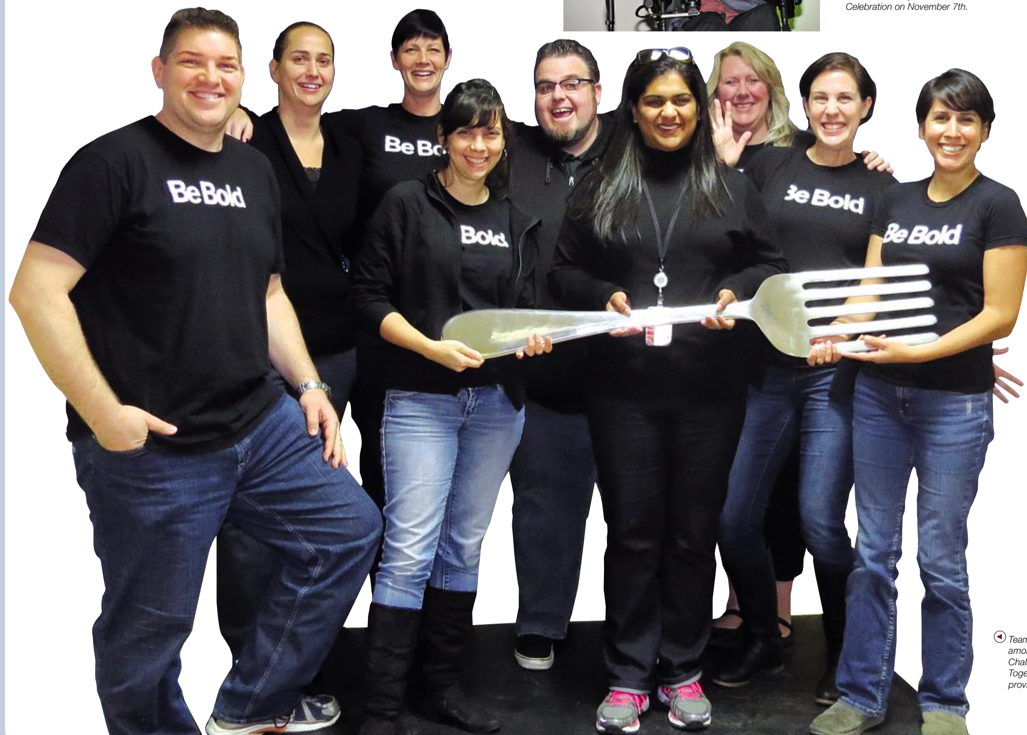
Team Bold from BlackBerry Carrier Affairs were among 16 teams participating the Great Food Sort Challenge at The Food Bank of Waterloo Region. Together, teams sorted enough donated food to provide more than 67,500 meals in our community.

Look for the next Erb and Erb "Helping Hands" feature December 27th, 2015! Deadline for photo submissions is December 24th, 2014!