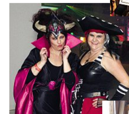
The Rotary Club of Waterloo kicked-off the first annual Fundraising Halloween SPOOKTACULAR Costume Bash at The Boardwalk Medical Centre in support of Rotary Waterloo Charitable Activities.