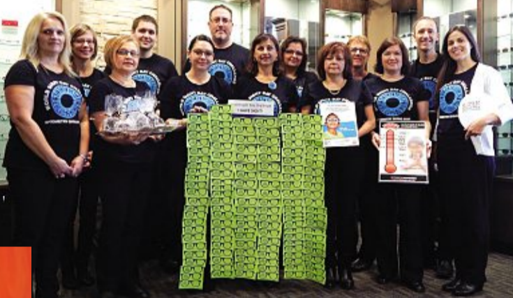
The staff and patients at Dolman Eyecare Centre raised $1,884.50 for Optometry Giving Sight, an organization dedicated to providing sustainable eye care and glasses to developing countries to help prevent blindness. The staff dedicated the month of October to fundraising for the organization and held a bake sale and raffle to help reach their fundraising goal.