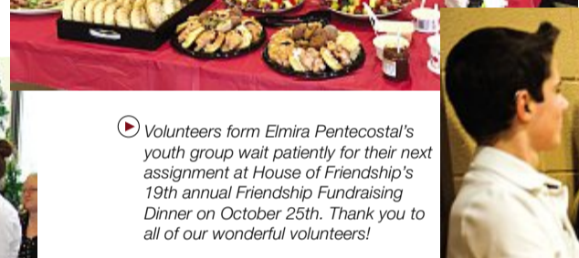
Volunteers from Elmira Pentecostal's youth group wait patiently for their next assignment at House of Friendship's 19th annual Friendship Fundraising Dinner on October 25th. Thank you to all of our wonderful volunteers!