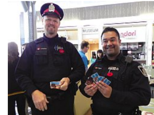
Members of the Waterloo Regional Police Service get ready to spread some kindness on Random Act of Kindness Day® on November 7th.