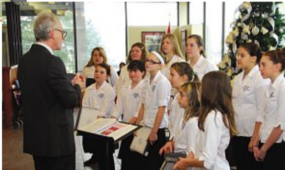
The Cambridge Girls Choir performs at The Trees of Caring Kick-Off event on November 6th. The Trees of Caring Campaign allows people to purchase tree lights to decorate the evergreen trees outside of the Cambridge Memorial Hospital. Funds raised support the CMH.