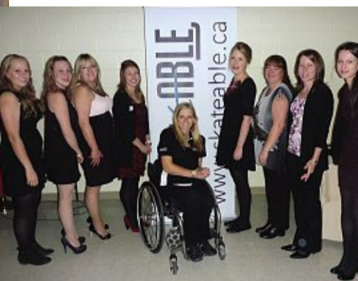
On Nov 7th, SkateABLE Adaptive Ice Skating partnered with the Canadian Paralympic Committee and KidSport KW to present the Changing Minds, Changing Lives dinner and silent auction to raise awareness about the importance of getting involved in parasport, and to raise funds for the SkateABLE adaptive ice skating programs in Waterloo and